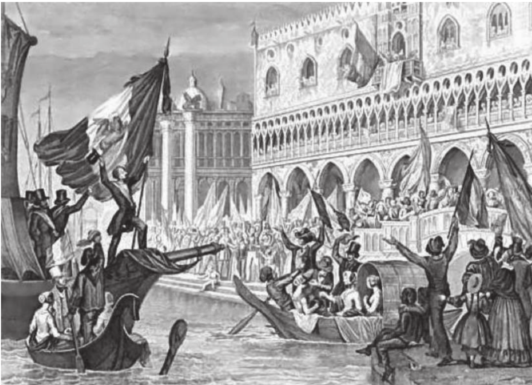
A drawing from the time of Daniele Manin proclaiming the Republic of Venice in 1848.