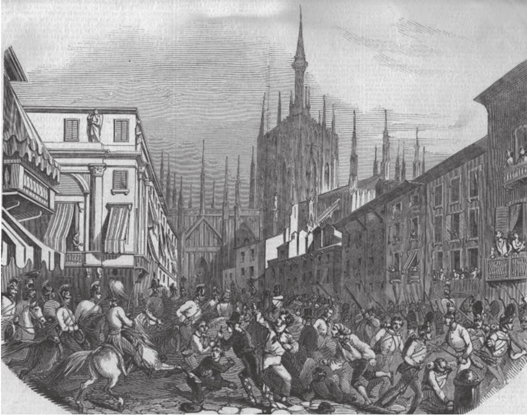
A drawing from the time of the uprising in Milan in March 1848.